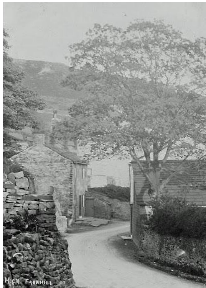
Main Street, High Farnhill, showing number 42