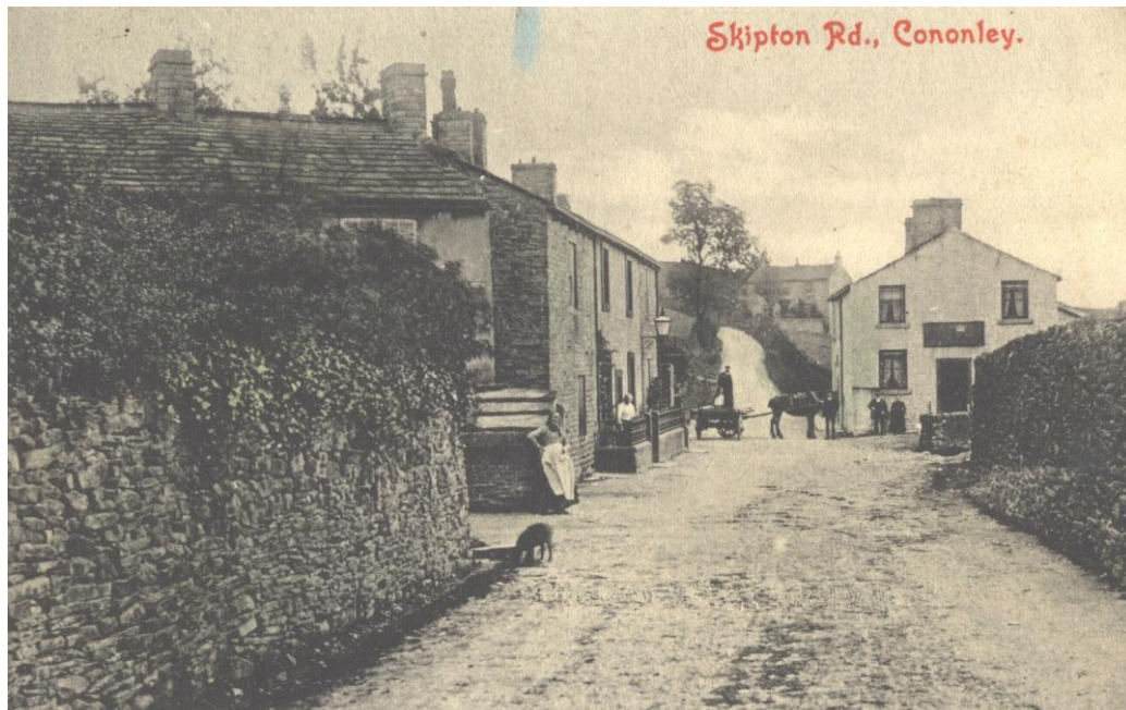
Crown Inn, Cononley (facing). The inn closed in 1907.