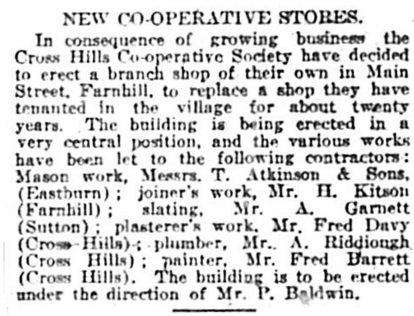
From Keighley News, 20/3/1926

In 1926 Kitson's Joinery, won the contract for the joinery work for new Co-op building in Farnhill Main Street.