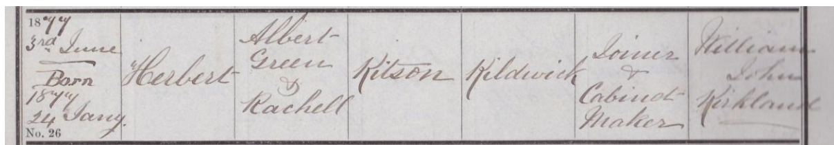
Scan of the baptismal register of Farnhill Primitive Methodist Chapel

Note: This will have been the chapel that preceded the building which closed in 2015. It was located further down Farnhill Main Street and has since been demolished.