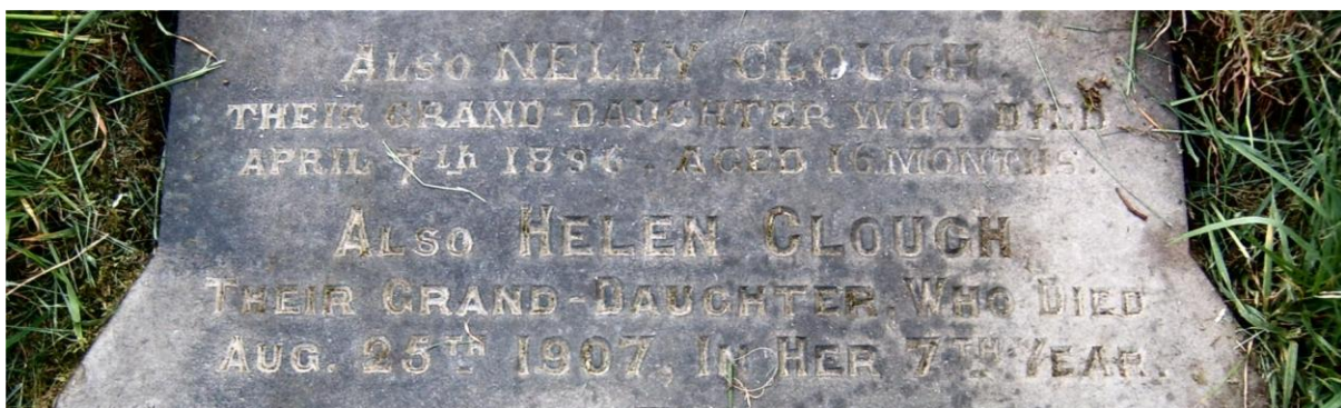
Part of the Clough family gravestone in Kildwick graveyard – fallen and partially overgrown