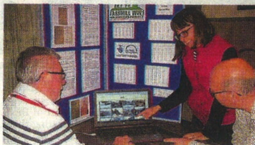
Members of the Farnhill WW1 Volunteers Project putting the finishes touches to their display and new website

"We'll be displaying some of these at the event and thanks to Heritage Lottery funding our